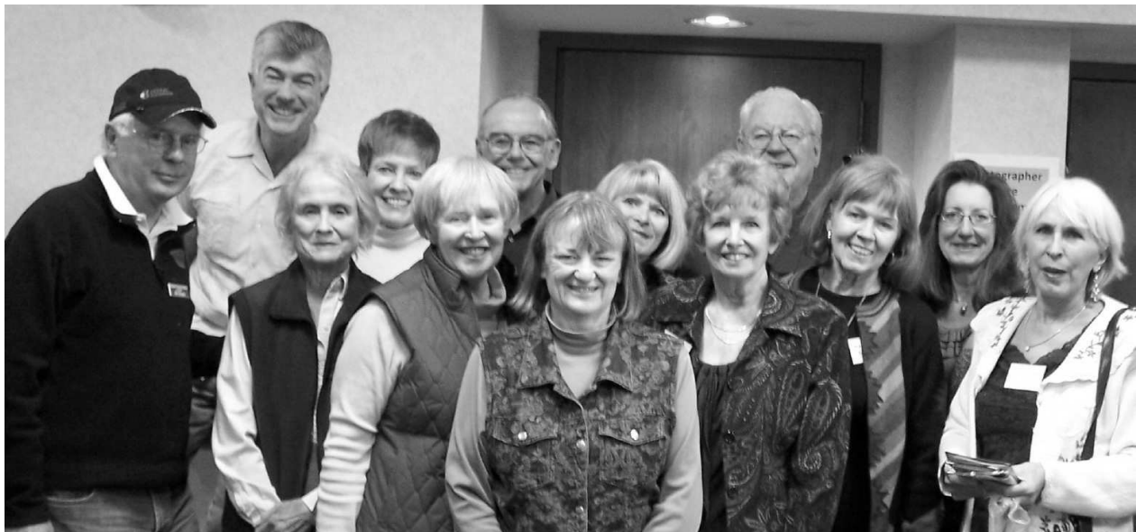
Most of the fifteen players who are here from the Summit BC in Frisco, CO (elevation 9042 feet)